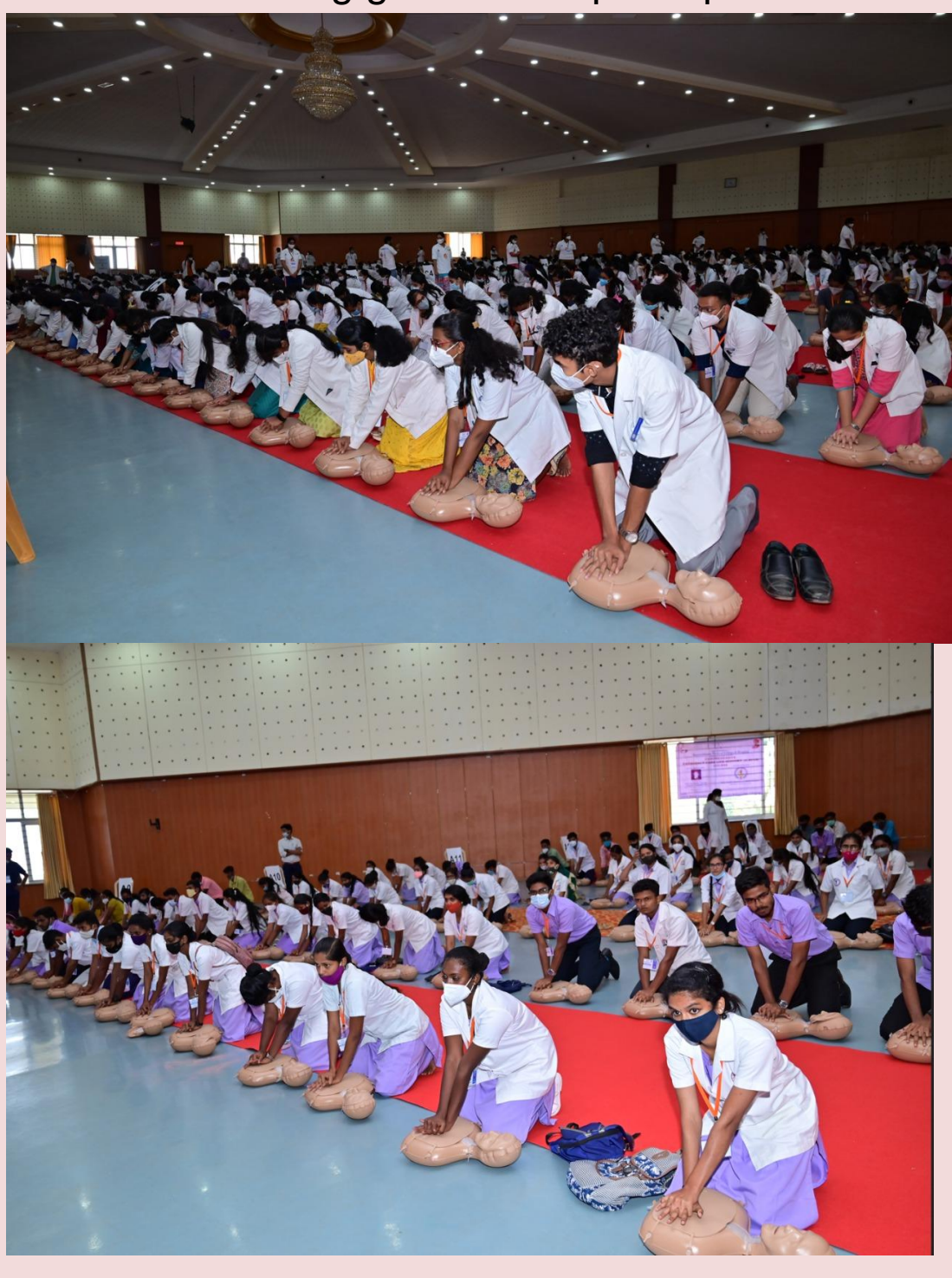
Training given to the participants

saving knowledge and skills of CPR and bleeding management needed to save lives.